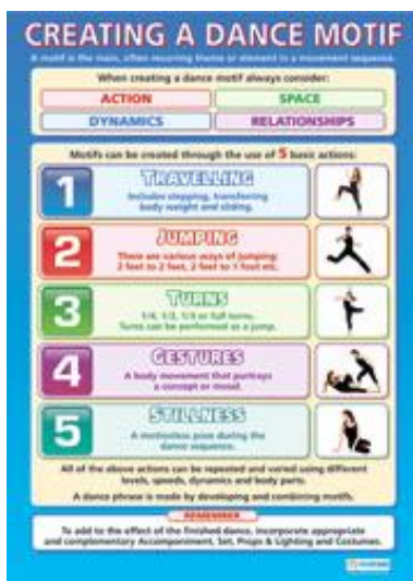
Creating A Dance Motif (A1 size) Code: DAN 5