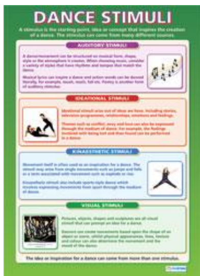
Dance Stimuli (A1 size) Code: DAN 4