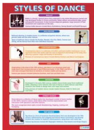
Style of Dance (A1 size) Code: DAN 2