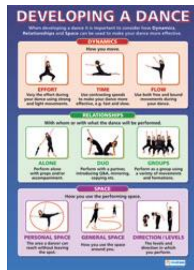
Developing A Dance (A1 size) Code: DAN 6