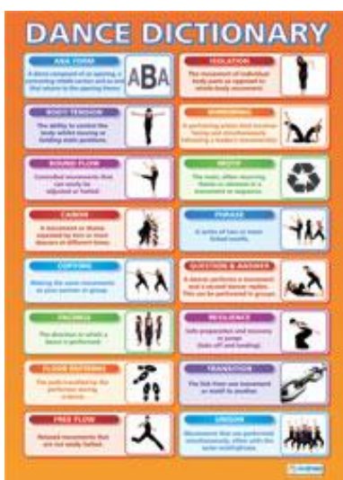
Dance Dictionary (A1 size) Code: DAN 1