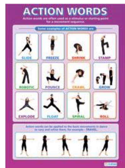
Action Words (A1 size) Code: DAN 3