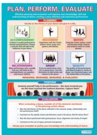
Plan, Perform, Evaluate (A1 size) Code: DAN 8